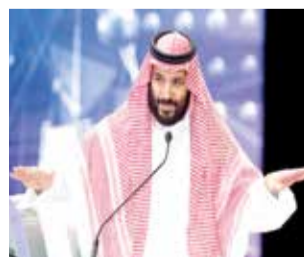
Saudi Crown Prince Mohammed bin Salman