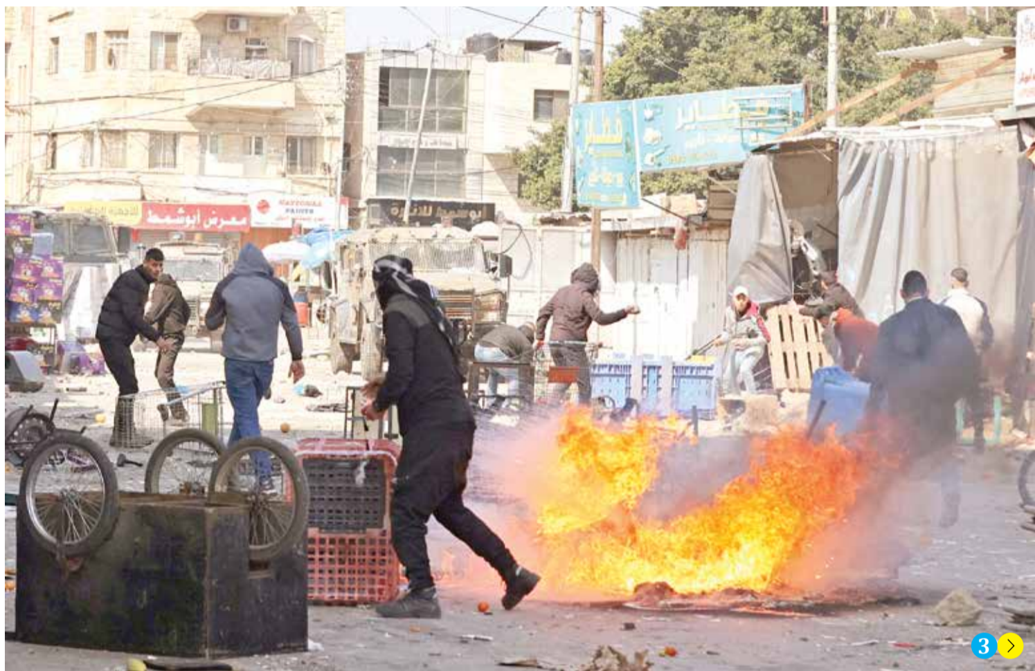
Palestinians clash with Israeli forces amid a raid by the regime troops in the occupied West Bank city of Nablus, Palestine, on February 22, 2023.