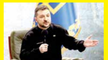
Ukrainian President Volodymyr Zelenskyy attends a news conference on the first anniversary of the Ukraine war in Kyiv, Ukraine, on February 24, 2023.

China called for a comprehensive ceasefire in Ukraine on Friday, and Ukrainian President Volodymyr Zelenskyy said he was open to considering parts of a 12-point peace plan put forward by Beijing. On the first anniversary of the Ukraine war, Moscow's ally China urged both sides to agree to a gradual de-escalation, warned against the use of nuclear weapons, and said conflict benefited no one, Reuters reported. The plan, set out in a foreign ministry paper, was largely a reiteration of China's line since Russia launched its "special military operation" on February 24 last year.