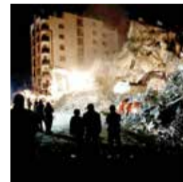
Workers clean the rubble of a collapsed building in the aftermath of a deadly earthquake in Antakya, Hatay Province, Turkey, on February 21, 2023.

The death toll from a 7.8-magnitude earthquake that struck Türkiye and Syria on Feb. 6 climbed above 50,000 after the former declared more than 44,000 people died. The Disaster and Emergency Management Authority (AFAD) said the death toll in Türkiye due to earthquakes rose to 44,218 on Friday night. With Syria's latest announced death toll of 5,914, the combined death toll in the two