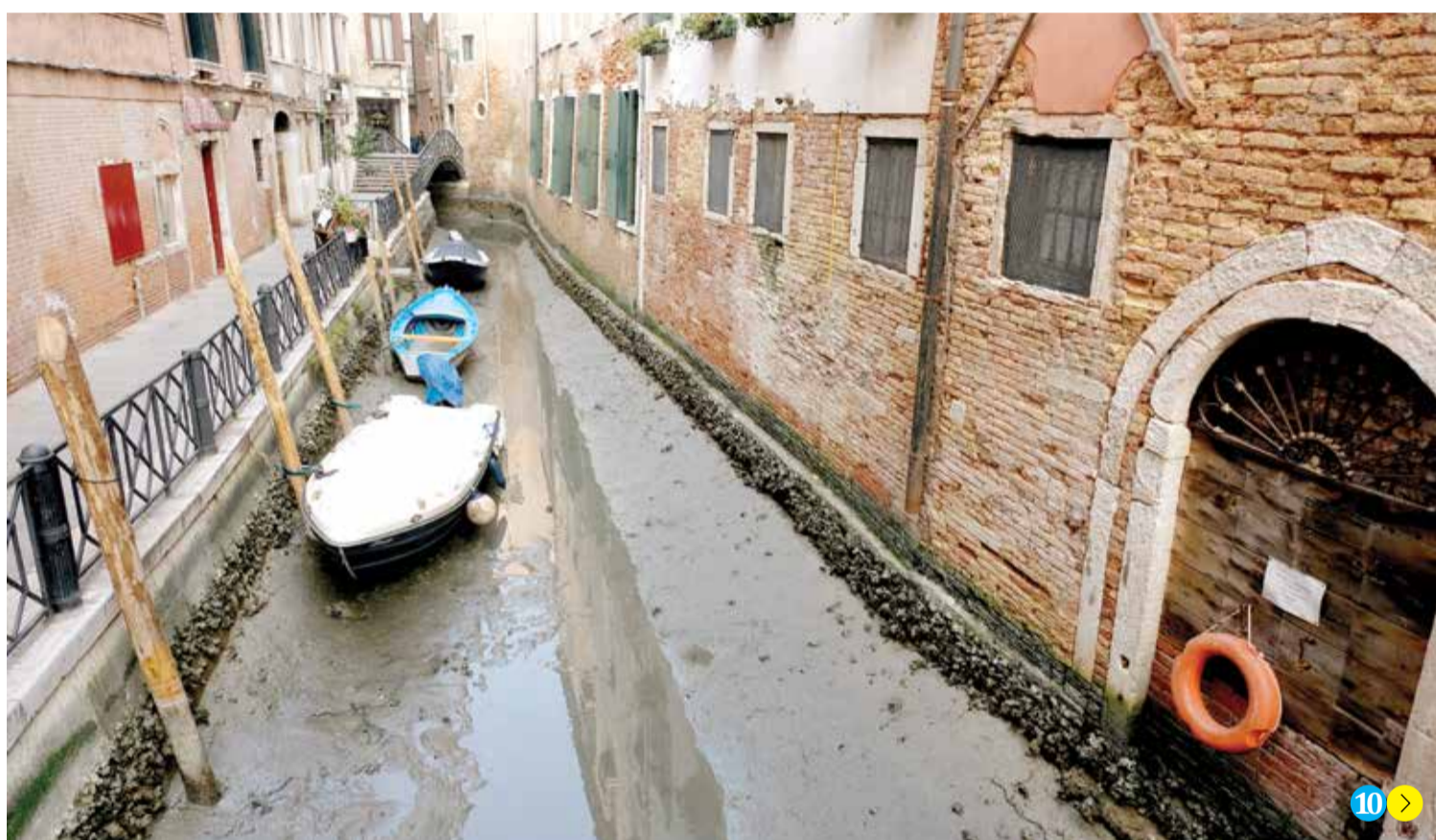
Boats are pictured in a canal during a severe low tide in the lagoon city of Venice, Italy, on February 17, 2023.