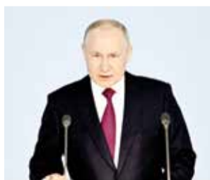
Russian President Vladimir Putin delivers his annual address to the Federal Assembly in Moscow, Russia, on February 21, 2023.