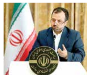
Iran's Minister of Economic Affairs and Finance Ehsan Khandouzi speaks in a press conference in Tehran on February 21, 2023.