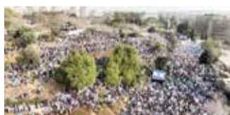
An aerial view shows Israelis protest against the cabinet judicial reforms outside the Knesset in Al-Quds on February 20, 2023.

Protesters blocked roads in cities across Israel during demonstrations Monday as the cabinet of Prime Minister Benjamin Netanyahu introduced a controversial judicial overhaul bill. The judicial overhaul bill is due for the first of three readings in parliament, the Knesset, on Monday, despite weeks of protests and calls from Israel's President Isaac Herzog and the United States to delay the legislation and negotiate, CNN reported. Netanyahu's coalition is seeking the most sweeping overhaul of the Israeli legal system. The most significant changes would allow a