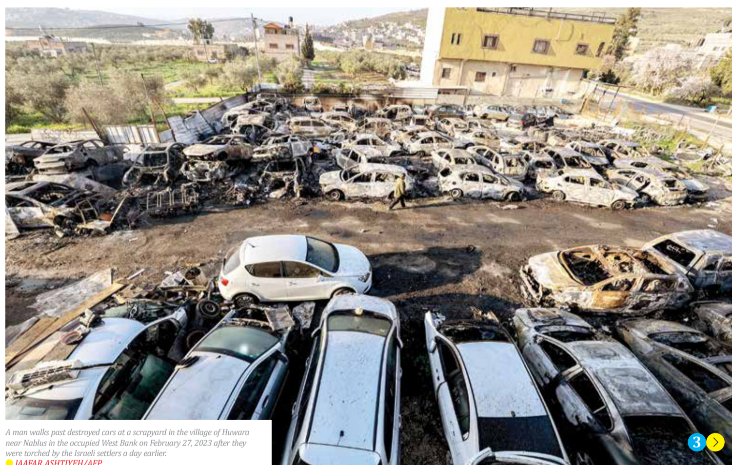
A man walks past destroyed cars at a scrapyard in the village of Huwara near Nablus in the occupied West Bank on February 27, 2023 after they were torched by the Israeli settlers a day earlier.