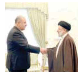
Iranian President Ebrahim Raeisi (R) shakes hands with Iraqi Defense Minister Thabet Muhammad Saeed al-Abbasi in a meeting in Tehran on February 26, 2023.

Iranian President Ebrahim Raeisi said Iraq must not be used for plots and threats against its neighbors. "The Islamic Republic of Iran supports the Iraqi government's efforts for the economic and military reconstruction of this country," Raeisi said in a meeting with Iraqi Defense Minister Thabet Muhammad Saeed al-Abbasi in Tehran on Sunday. He said that Iran and Iraq have joint borders of