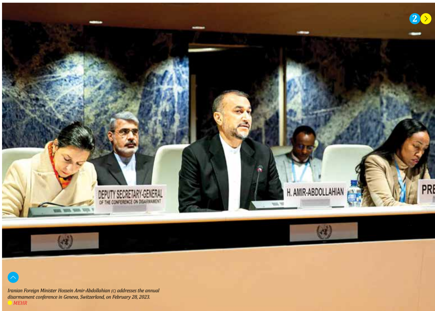
Iranian Foreign Minister Hossein Amir-Abdollahian (c) addresses the annual disarmament conference in Geneva, Switzerland, on February 28, 2023.