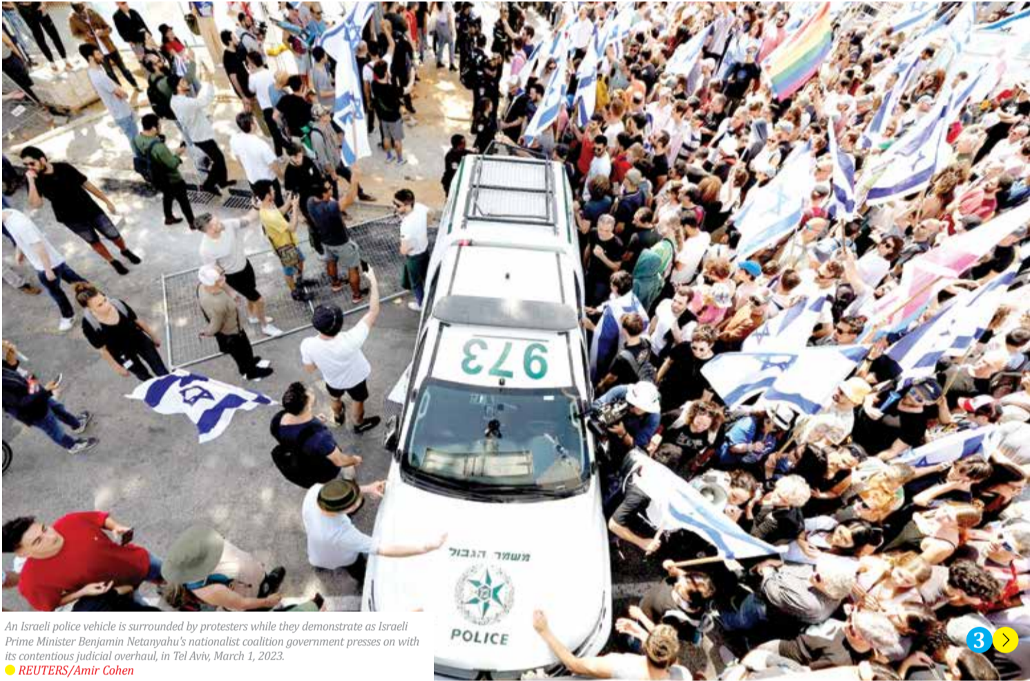
An Israeli police vehicle is surrounded by protesters while they demonstrate as Israeli Prime Minister Benjamin Netanyahu's nationalist coalition government presses on with its contentious judicial overhaul, in Tel Aviv, March 1, 2023.