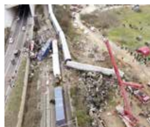
● GIANNIS PAPANIKOS/AP

At least 36 people were killed and 66 injured when two trains collided head-on near the Greek city of Larissa, authorities said, as emergency services raced Wednesday to find survivors among the charred wreckage. Several carriages were almost completely destroyed in the collision between a passenger train and a freight train just before midnight on Tuesday, with at least one car appearing to catch fire and trap passengers inside, AFP reported. Health Minister Thanos Plevris said most passengers were "young people", with the train carrying many students returning to Thessaloniki after a long holiday weekend. Iranian Foreign Ministry Spokesman Nasser Kanaani expressed condolences to the Greek government and people over Tuesday's deadly collision that claimed dozens of lives.