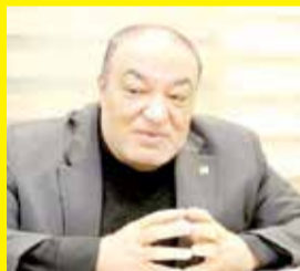
Iran's Deputy Foreign Minister for Economic Diplomacy Mehdi Safari.