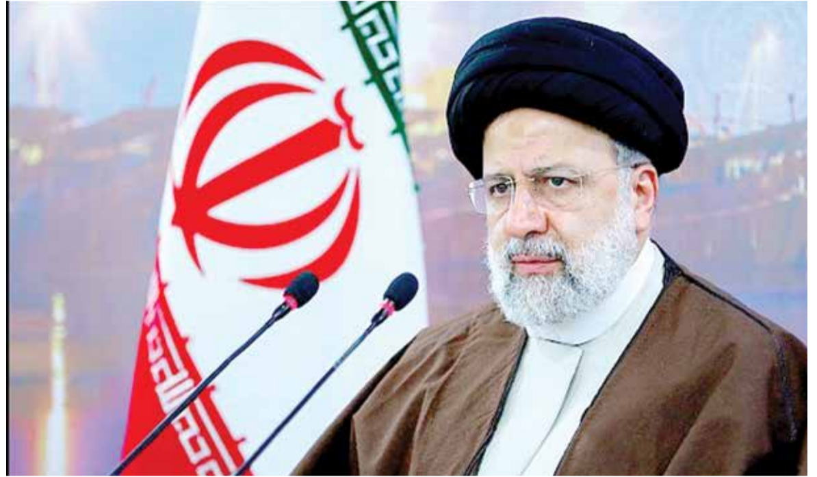
Iranian President Ebrahim Raeisi speaks at a press conference in Bushehr, Iran, on March 2, 2023.

Iranian President Ebrahim Raeisi stated that the government is seeking to curb gas wastage in the country's refineries and solve the issue of pollutants by enabling more than 500 knowledge-based companies. Attending a press conference at the end of the two-day trip to the Bushehr Province on Friday evening, President Raeisi said that Iran's wealth should not be allowed to be wasted in Asaluyeh, according to. He noted that following the trip, "both short-term and long-term projects that require more funds and credits were put on the agenda" to accelerate the development of the southern region of Iran. "More than 40% of the short-term and medium-term plans of my first trip to Bushehr have already been completed." He also stated that the province's roads and main roads were particularly under scrutiny during his trip, expressing satisfaction with the measures just taken by the govern