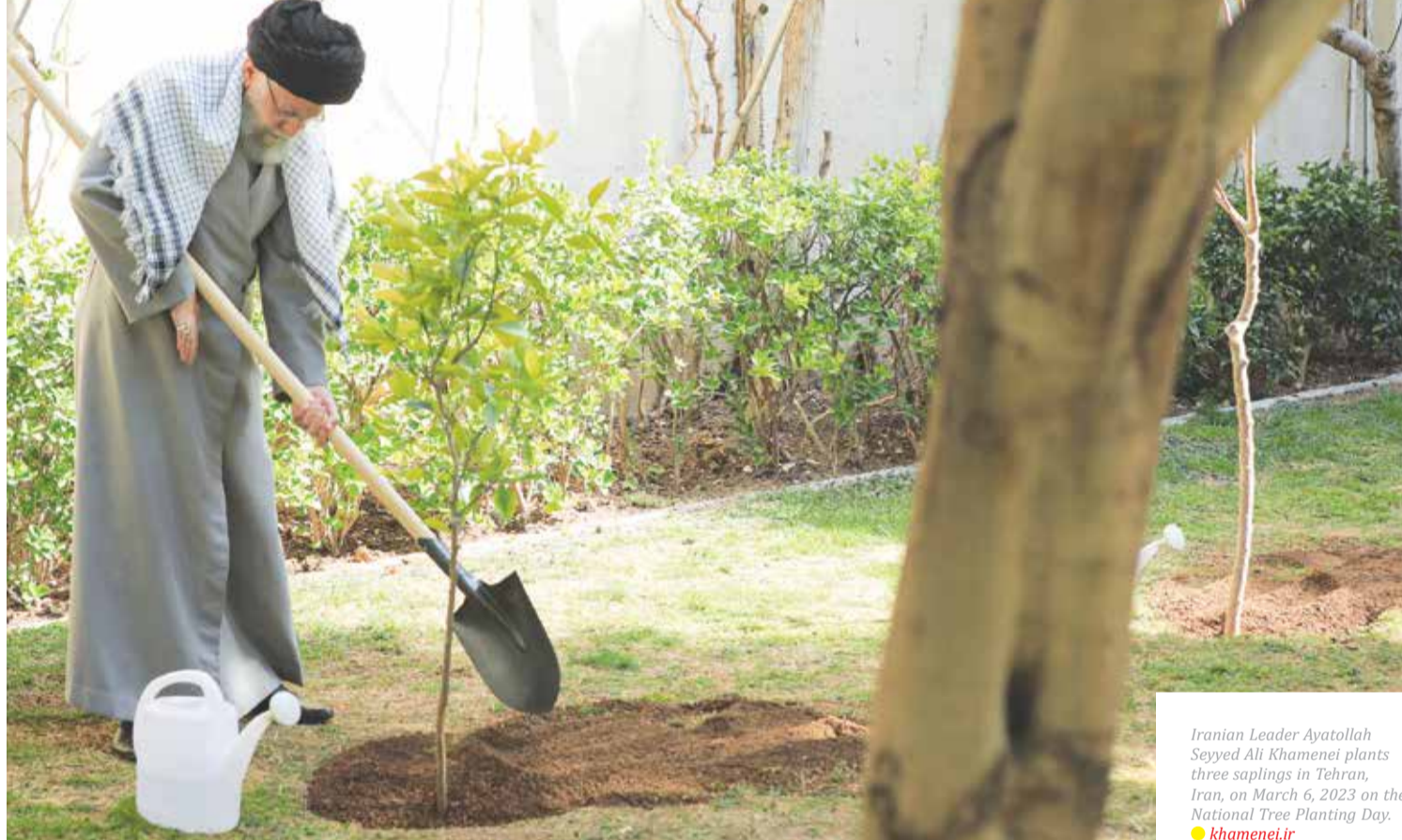
Iranian Leader Ayatollah Seyyed Ali Khamenei plants three saplings in Tehran, Iran, on March 6, 2023 on the National Tree Planting Day.