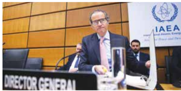
Rafael Grossi, the director general of the International Atomic Energy Agency (IAEA), attends the IAEA's Board of Governors' meeting at the agency's headquarters in Vienna, Austria on March 6, 2023.