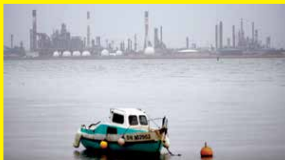
subsidary Esso, a spokesperson for hardline union CGT said. "The strike has been lifted at Port Jerome since Wednesday, but we are hopeful it will be there again next week," the CGT spokesperson said. Disruptions also continued at liquefied natural gas (LNG) terminals, with company Fluxys saying that their Dunkirk terminal jetty and truck loading bay were unavailable and delivery capacity was reduced to a minimum. The disruptions were expected to continue until Tuesday, Fluxys said. French power supply was also reduced by 14.4 gigawatts (GW) at nuclear, thermal and hydropower plants, a CGT spokesperson said. Power supply disruptions have lasted for over a week. That equates to 22% of current total power supply, data from grid operator RTE showed. REUTERS

Deliveries were blocked from leaving TotalEnergies' refineries and depots on Friday, a company spokesperson said, as workers extended a strike over planned pension reforms to a fourth day. About 40% of the morning shift of refinery operators were continuing the strike, the spokesperson said. Deliveries were also disrupted at the Fos refinery, operated by ExxonMobil