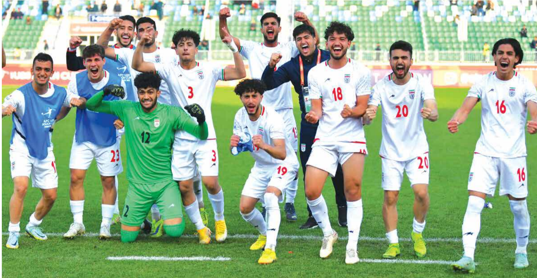
Iranian players celebrate a 3-1 victory over Vietnam in the AFC U20 Asian Cup in Fergana, Uzbekistan, on March 7, 2023.