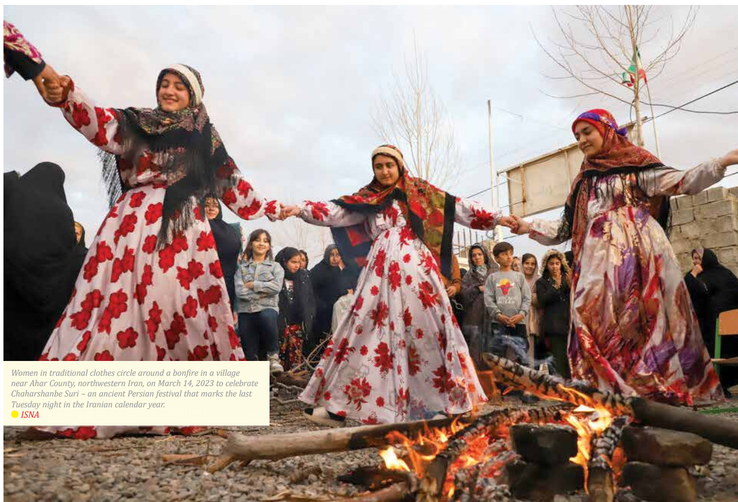
Women in traditional clothes circle around a bonfire in a village near Ahar County, northwestern Iran, on March 14, 2023 to celebrate Chaharshanbe Suri – an ancient Persian festival that marks the last Tuesday night in the Iranian calendar year.