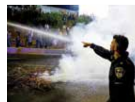
A member of security forces gestures as demonstrators rally against Israeli Prime Minister Benjamin Netanyahu and his nationalist coalition cabinet's plan for judicial overhaul in Tel Aviv on April 1, 2023.

between his extremist coalition and opposition parties. Israeli media estimated more than 150,000 people attended protests on Saturday, the largest in commercial hub Tel Aviv. Netanyahu, on trial on corruption charges he denies, says reforms are needed to balance the branches of power. His Likud party and political allies in the far-right have been calling on their political base to stage counter demonstrations.