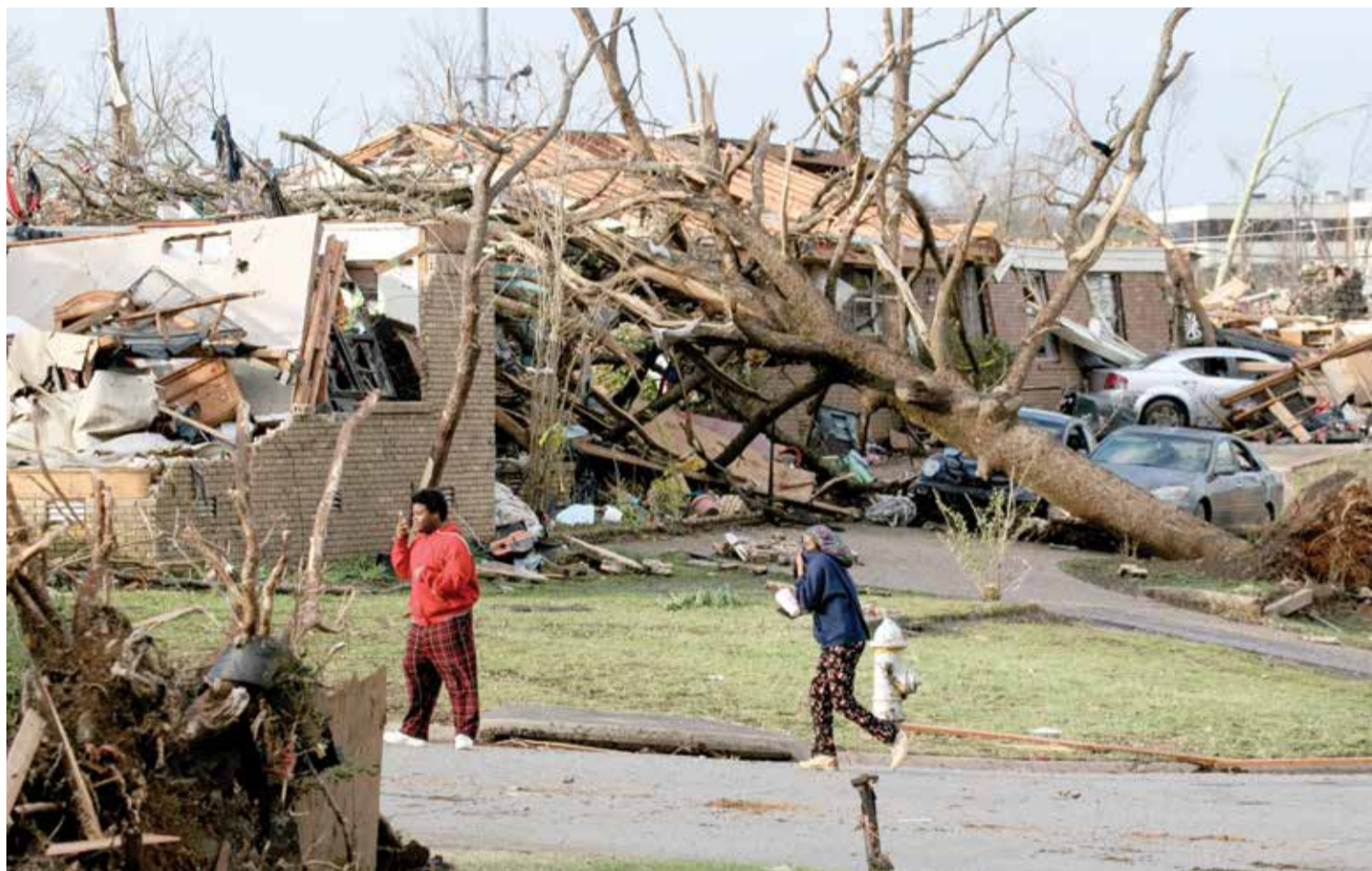
The damaged remains of the Walnut Ridge neighborhood are seen on April 1, 2023 in Little Rock, Arkansas, the US. Tornadoes damaged hundreds of homes and buildings across a large part of Central Arkansas.