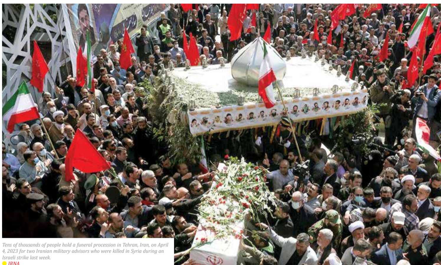
Tens of thousands of people hold a funeral procession in Tehran, Iran, on April 4, 2023 for two Iranian military advisors who were killed in Syria during an Israeli strike last week.