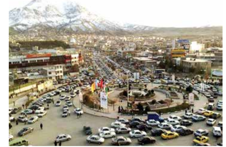
An overview of Baneh

Surin Plain is located in the Nanour district of Baneh, next to a village with the same name.