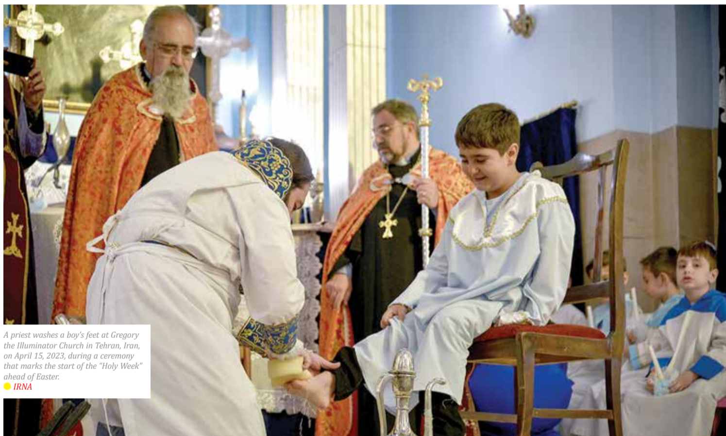
A priest washes a boy's feet at Gregory the Illuminator Church in Tehran, Iran, on April 15, 2023, during a ceremony that marks the start of the "Holy Week" ahead of Easter.