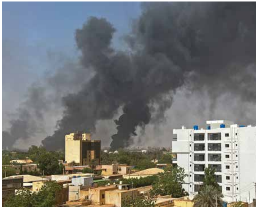
Smoke billows above residential buildings in Khartoum on April 16, 2023, as fighting in Sudan raged for a second day in battles between rival generals.

Iran urged military rivals in Sudan to show restraint and engage in talks to end the deadly clashes in the African country.