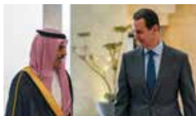
Syria's President Bashar al-Assad (R) receives Saudi Arabia's Foreign Minister Faisal bin Farhan in Damascus on April 18, 2023.

Syrian President Bashar al-Assad met with Saudi Arabia's top diplomat Faisal bin Farhan in Damascus on Tuesday, ending more than a decade of diplomatic deep-freeze between the two countries. The Saudi prince arrived in Damascus on Tuesday afternoon on the first visit to Syria's capital by a Saudi official since the start of the foreign-backed war in the country in 2011, AFP reported. A flurry of diplomatic activity has been underway in the past week as regional relations shift following a decision by Saudi Arabia and Iran