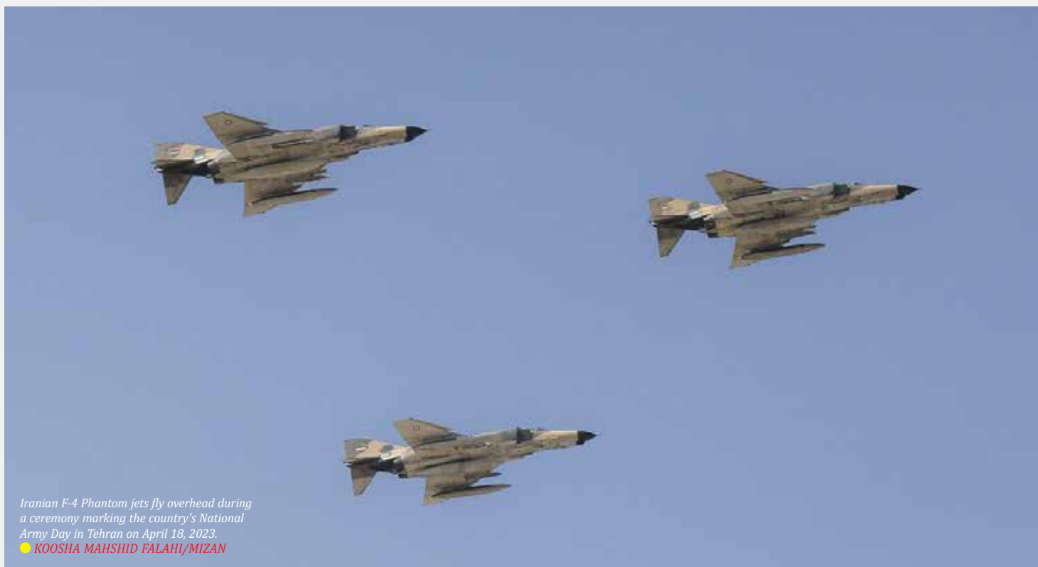
Iranian F-4 Phantom jets fly overhead during a ceremony marking the country's National Army Day in Tehran on April 18, 2023.