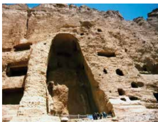
UNESCO stopped its initiative to preserve heritage sites in Bamiyan

in 2021. Overall, this event was unstoppable because of the Taliban who took over. The UNESCO initiative is a project with funding from Italy. The goal is to preserve the Bamiyan Valley. The Bamiyan Valley has a position on UNESCO's World Heritage Danger list from 2003. The valley contains mostly religiously focused art from the common era (3rd to 5th century C.E.). The project's objectives include enhancing the site's infrastructure and creating a long-term conservation strategy. What will increase in the process is the number of workforce from local communities. The focus will espe-