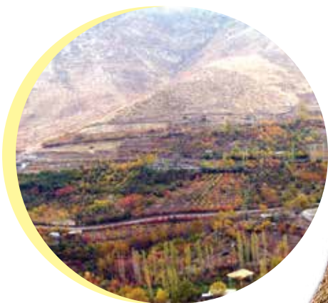
An overview of Dehgolan