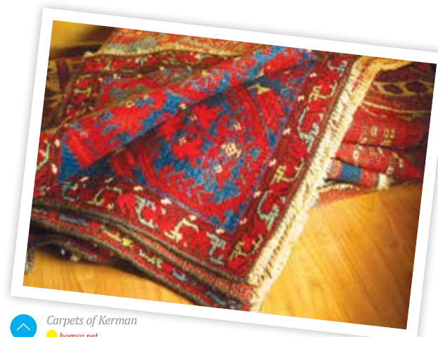
Carpets of Kerman