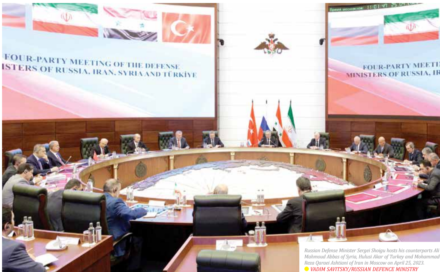
Russian Defense Minister Sergei Shoigu hosts his counterparts Ali Mahmoud Abbas of Syria, Hulusi Akar of Turkey and Mohammad-Reza Qaraei Ashtiani of Iran in Moscow on April 25, 2023.