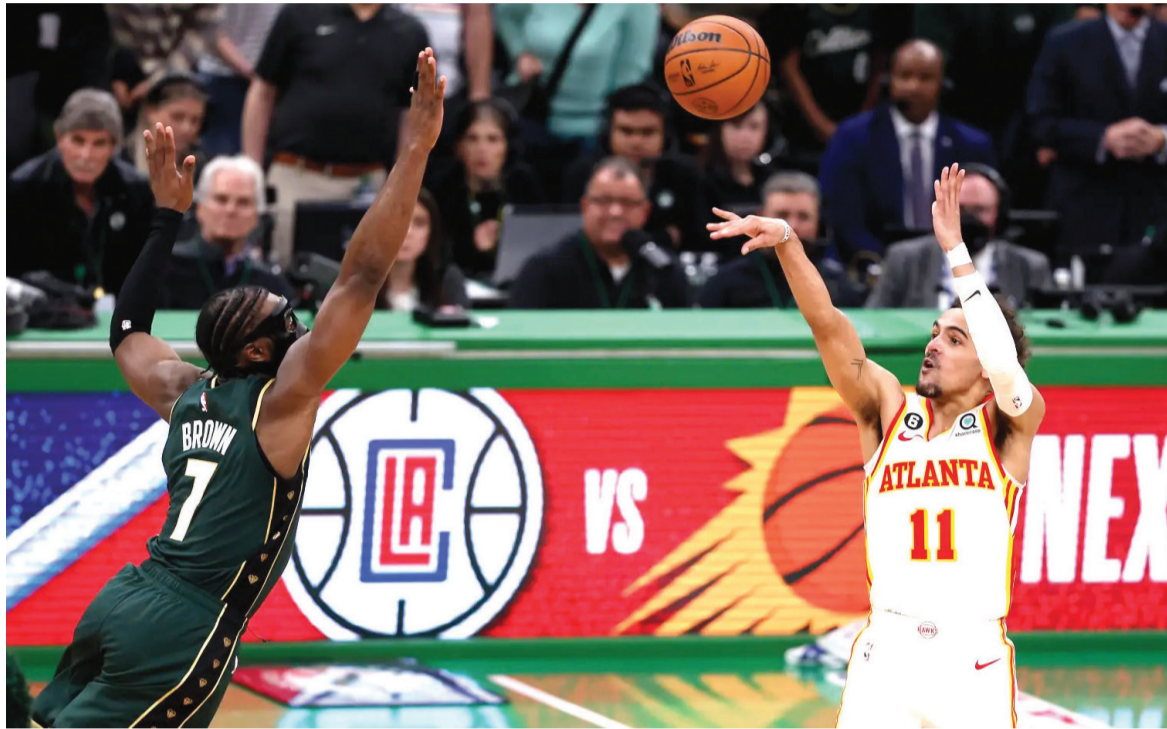
Hawks guard Trae Young (11) takes the game-winning shot over Celtics guard Jaylen Brown during the final seconds of Game 5 in a first-round NBA basketball playoff series at TD Garden, Boston, MA, US, on April 25, 2023.

"We were tough-minded," Snyder said. "It's tough to be down through the whole game. We were hanging in there and hang-