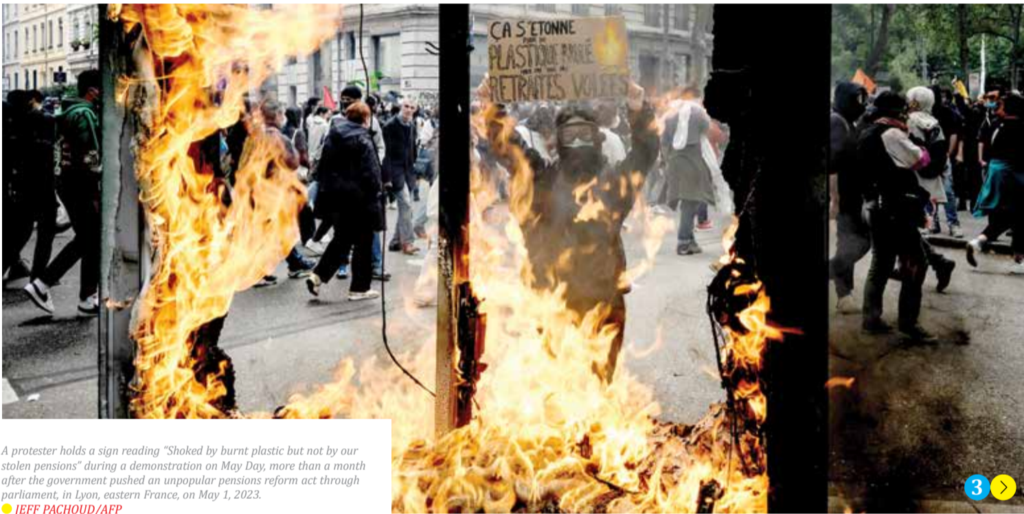
A protester holds a sign reading "Shoked by burnt plastic but not by our stolen pensions" during a demonstration on May Day, more than a month after the government pushed an unpopular pensions reform act through parliament, in Lyon, eastern France, on May 1, 2023.