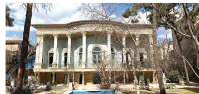
Mostofi al-Mamalek House

architecture, it has caused its residents not to leave the neighborhood.