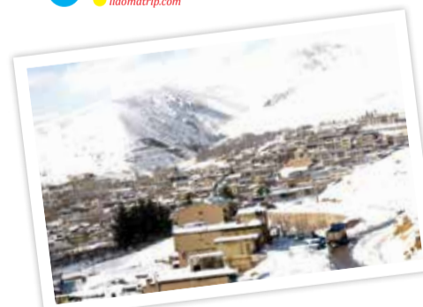
An overview of Sepidan ● hamshahrionline.ir