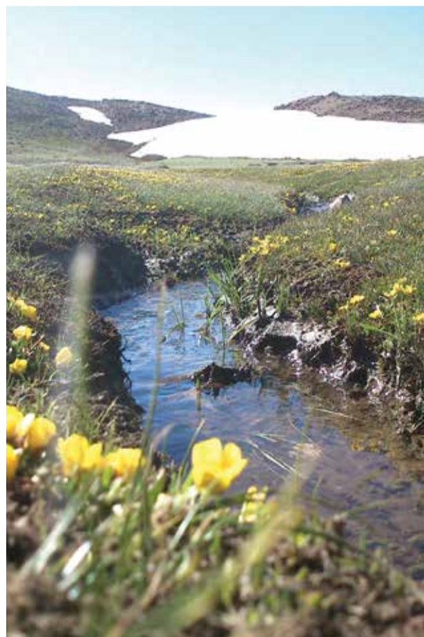
Nature of Sepidan ● alaedin.travel