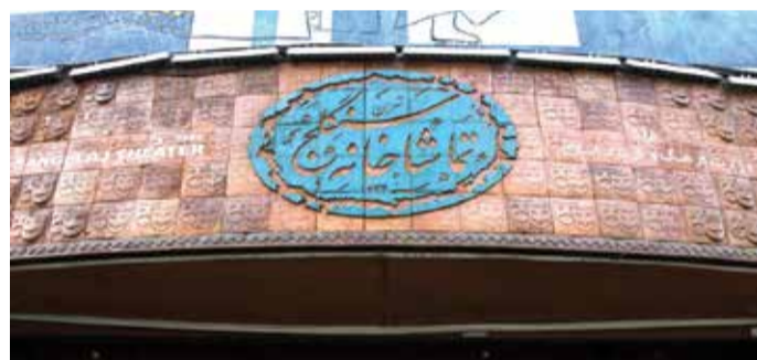
Sangelaj Theater ● mojnews.com

A large number of monuments of the old neighborhood are not open to the public, including Rajabali