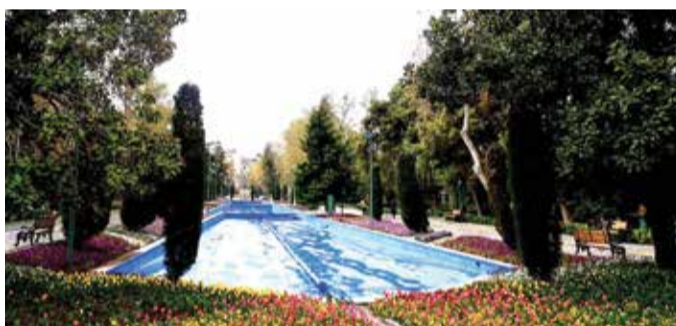
Park-e Shahr ● visitiran.ir