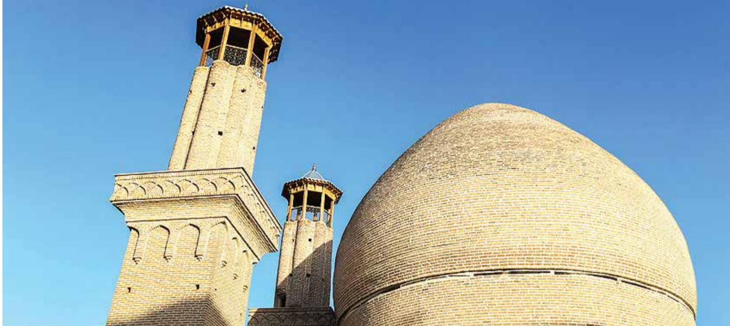
Moayer al-Mamalek Mosque

structures of the old neighborhood is its theater, which is still operating. Many famous Iranian theater directors staged their plays in the theater, which was inaugurated in 1955. It lies in the southern part of Park-e Shahr.