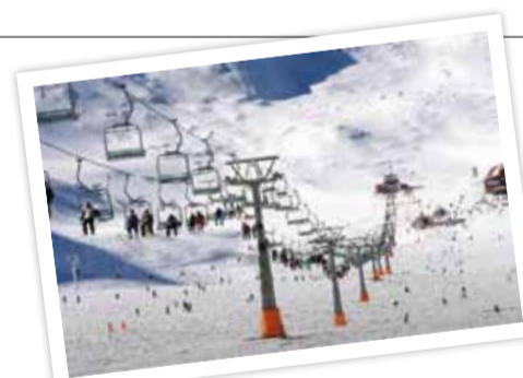
Sepidan's ski resort ● lidomatrip.com

The Sepidan MP noted that promoting tourism will definitely help generate revenues and jobs.