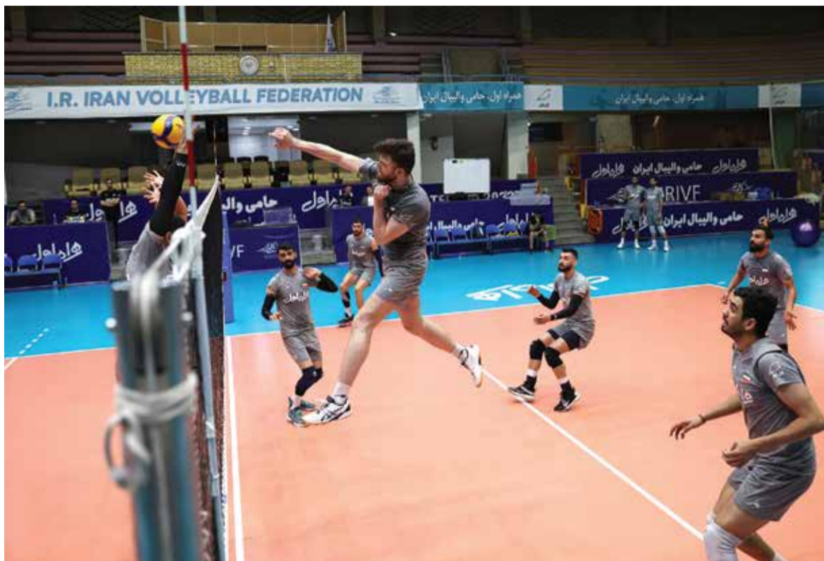
Iranian players are seen in a training session in Tehran, Iran, on April 29, 2023.