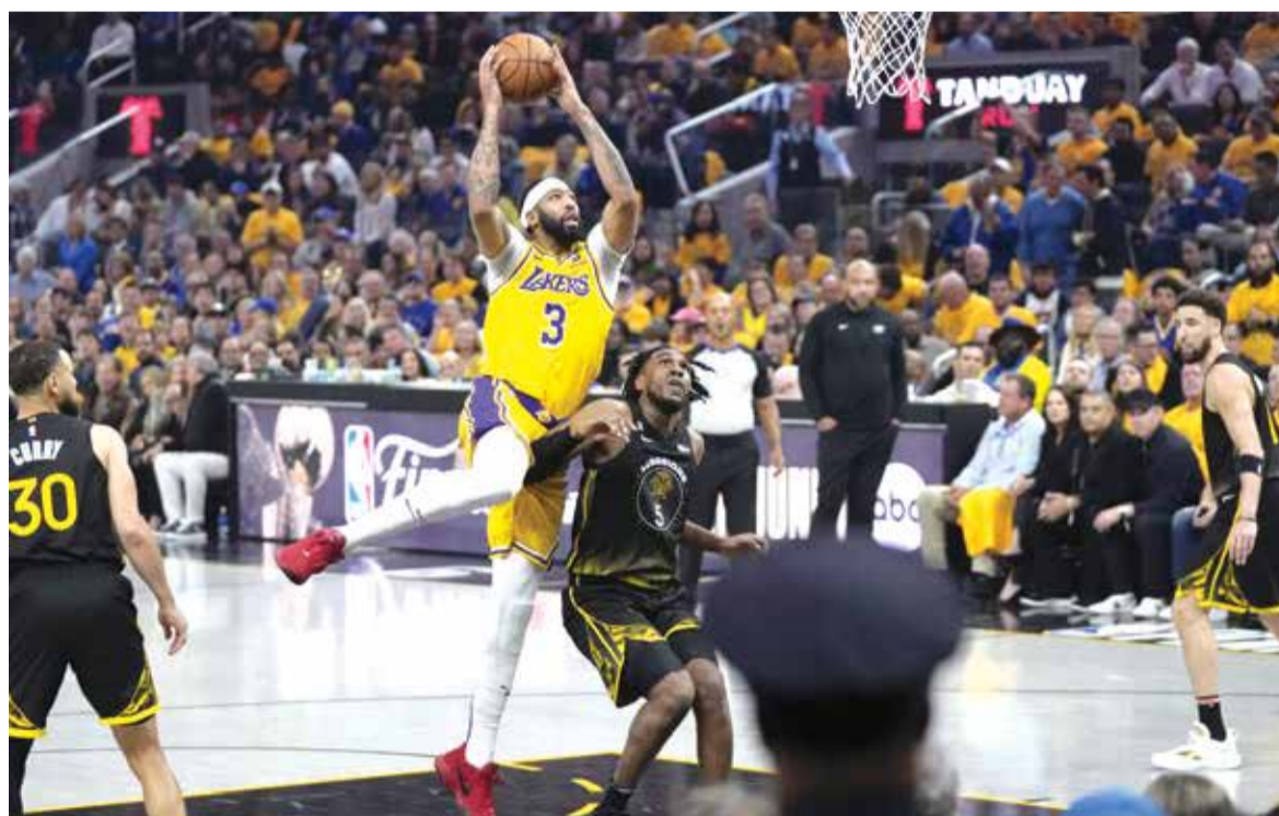
Lakers forward Anthony Davis (3) shoots during a victory over the Warriors in Game 1 of the NBA Western Conference semifinal in San Francisco, CA, US, on May 2, 2023.

James' 22 points were his third-fewest in 23 playoff