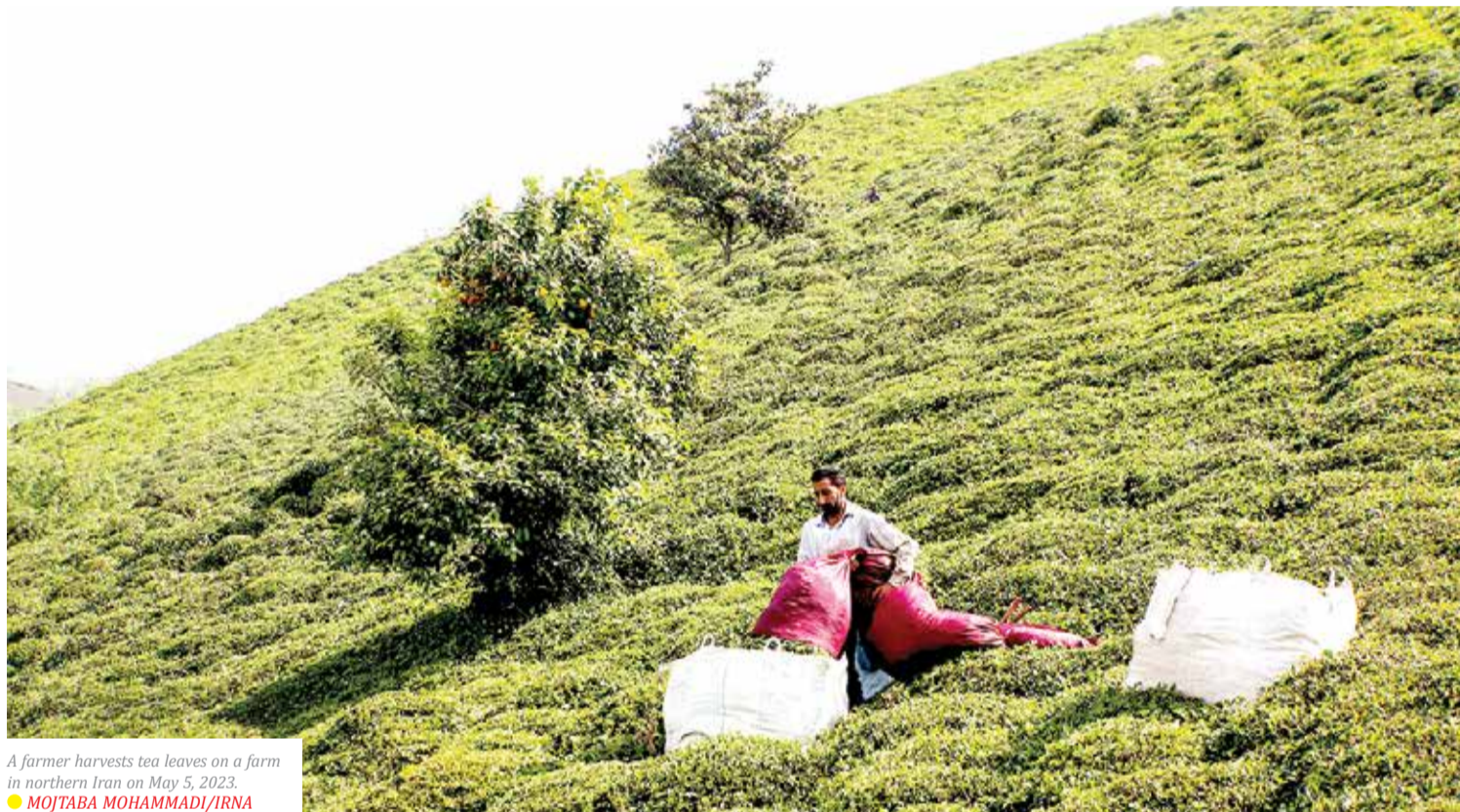
A farmer harvests tea leaves on a farm in northern Iran on May 5, 2023.