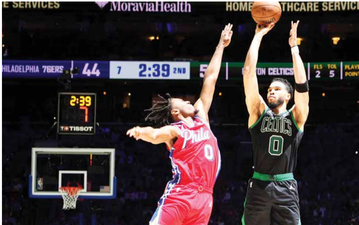
Celtics' Jayson Tatum (0) shoots during a victory over the 76ers in Game 3 of the NBA Eastern Conference semifinal series in Philadelphia, PA, US, on May 5, 2023.

Boston spiked any emotional carryover from the ceremony and raced to a quick 10-point lead.