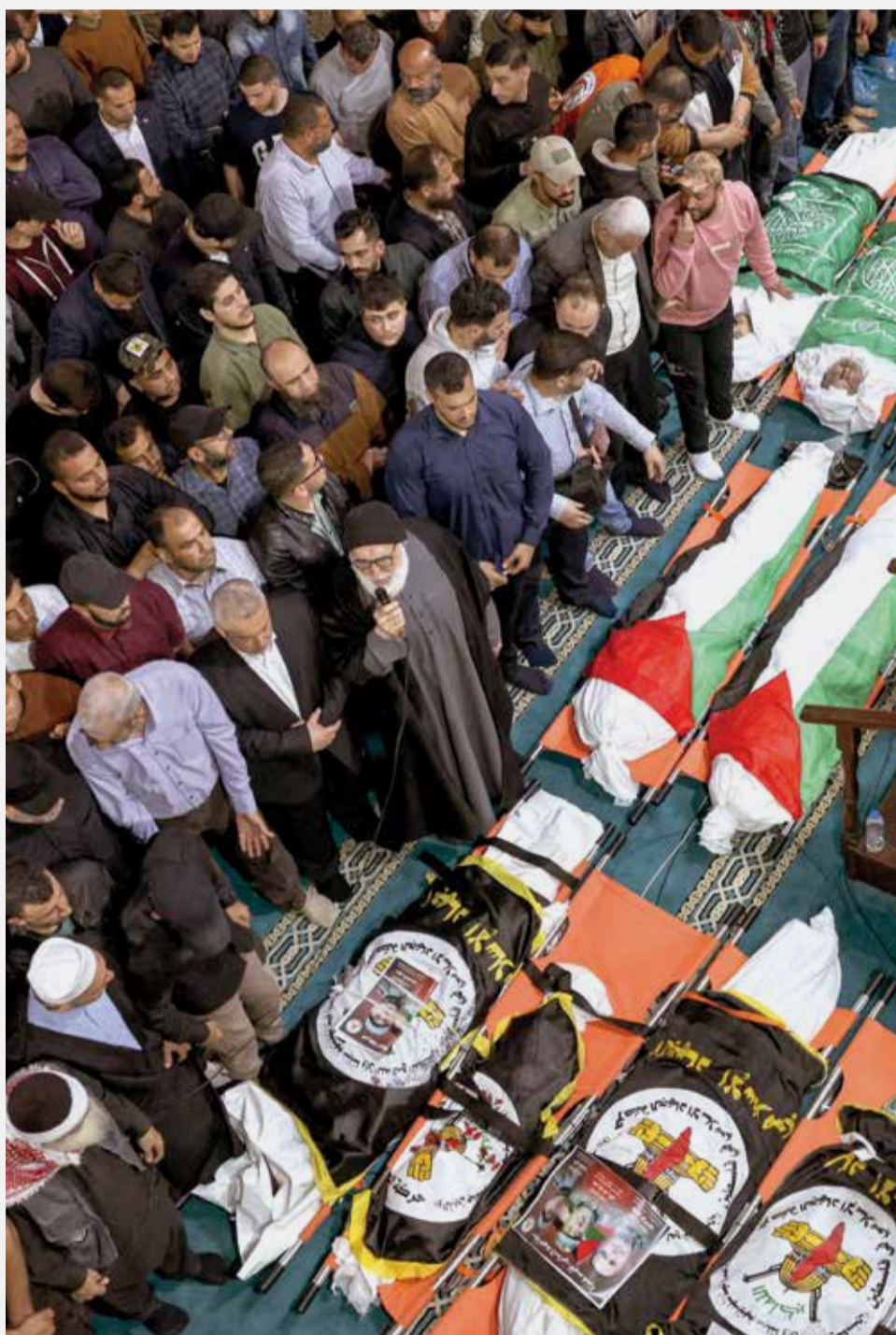
A Muslim cleric leads the prayer during a funeral in Gaza City for people killed in Israeli air raids on the Palestinian territory early on May 9, 2023.