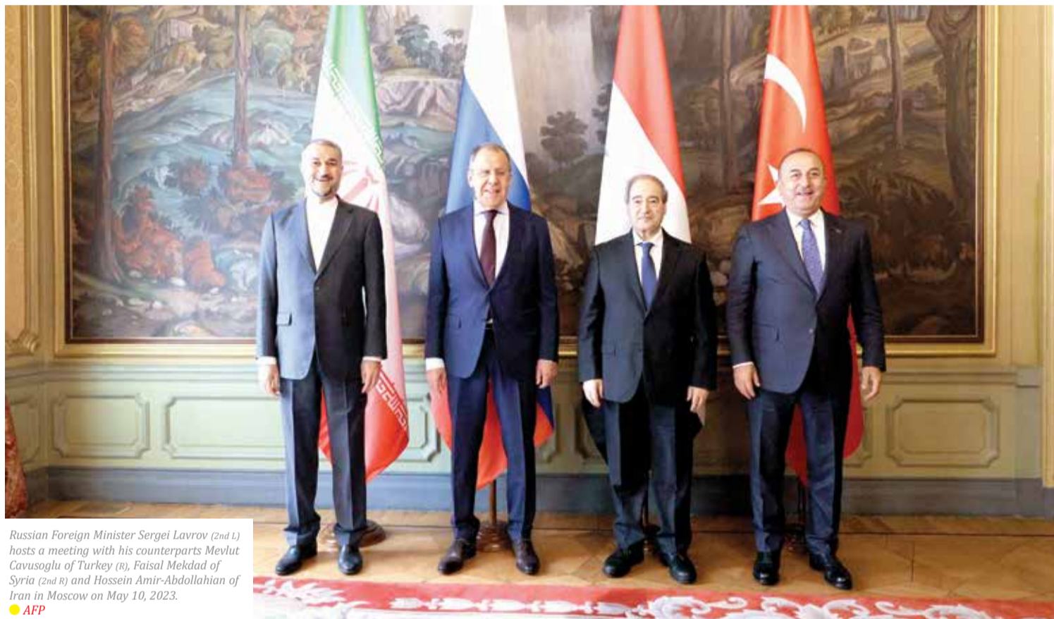
Russian Foreign Minister Sergei Lavrov (2nd L) hosts a meeting with his counterparts Mevlut Cavusoglu of Turkey (R), Faisal Mekdad of Syria (2nd R) and Hossein Amir-Abdollahian of Iran in Moscow on May 10, 2023.