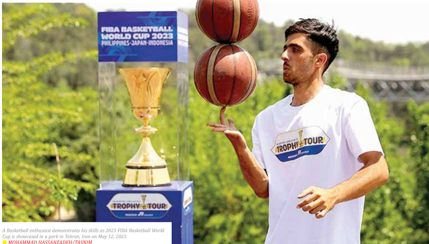
A Basketball enthusiast demonstrates his skills as 2023 FIBA Basketball World Cup is showcased in a park in Tehran, Iran on May 12, 2023.