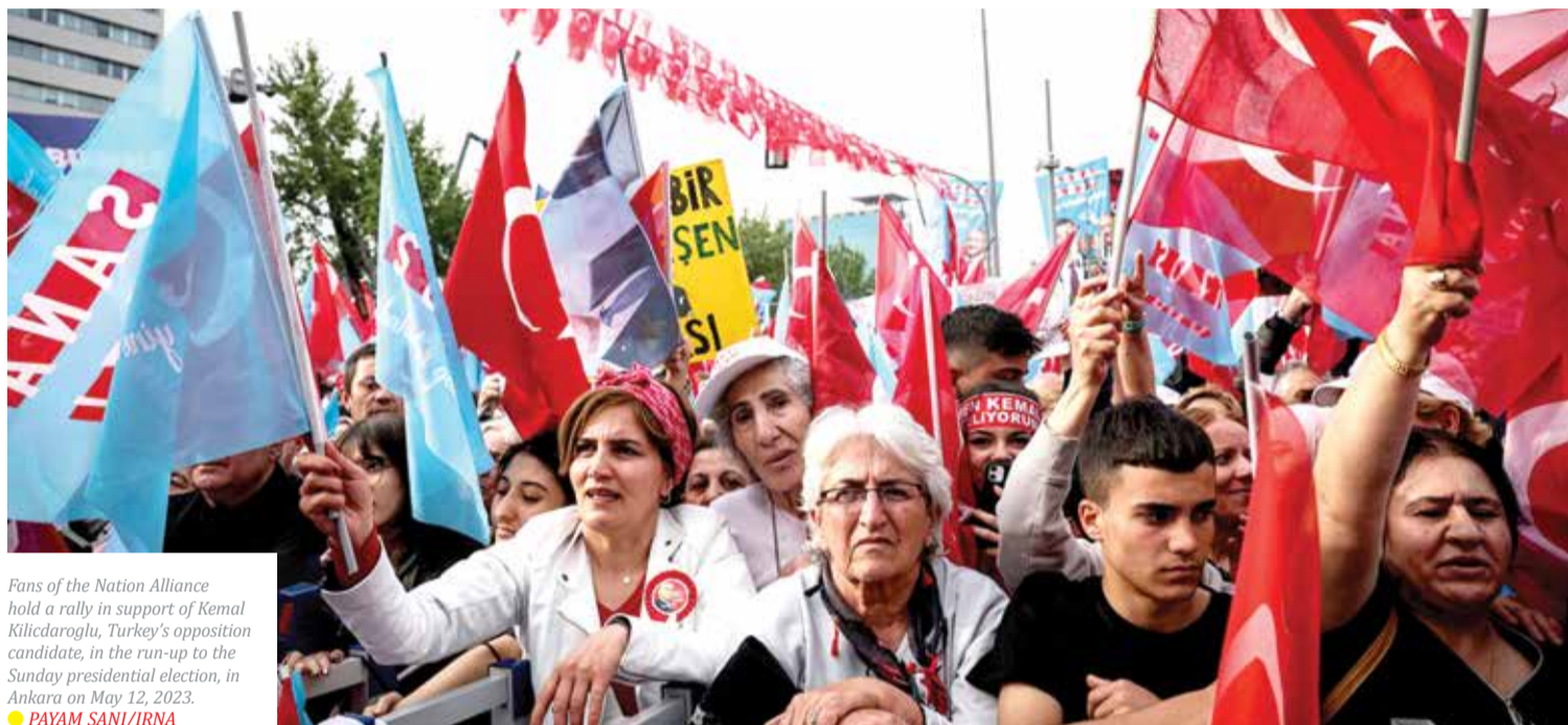
Fans of the Nation Alliance hold a rally in support of Kemal Kilicdaroglu, Turkey's opposition candidate, in the run-up to the Sunday presidential election, in Ankara on May 12, 2023.