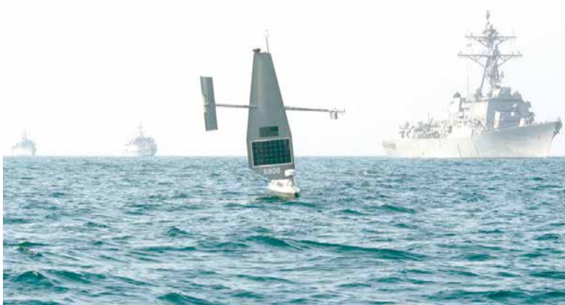
A Saikrone Explorer takes part in a joint US and UK naval drill in the Persian Gulf on Oct. 7, 2022.