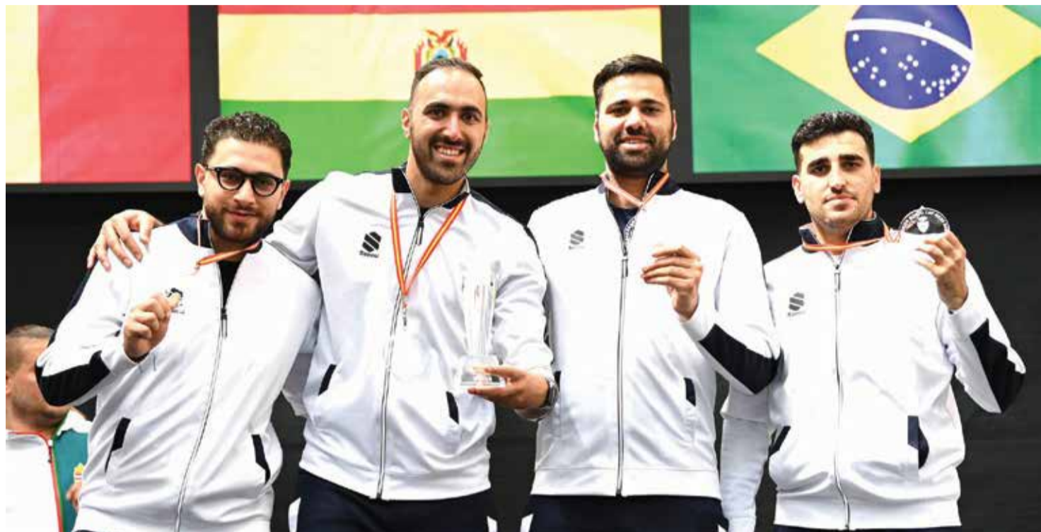
Iranian fencers pose for a photo after winning the team bronze at the Men's Sabre World Cup in Madrid, Spain, on May 14, 2023.