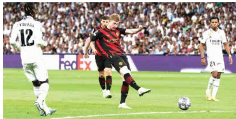
Kevin De Bruyne (C) fires home Manchester City's equalizer in a 1-1 draw against Real Madrid in Santiago Bernabeu, Madrid, Spain, on May 9, 2023.

Real's own run to Champions League glory last season was fuelled by goalkeeper Thibaut Courtois' perceived slight at his reputation in England.