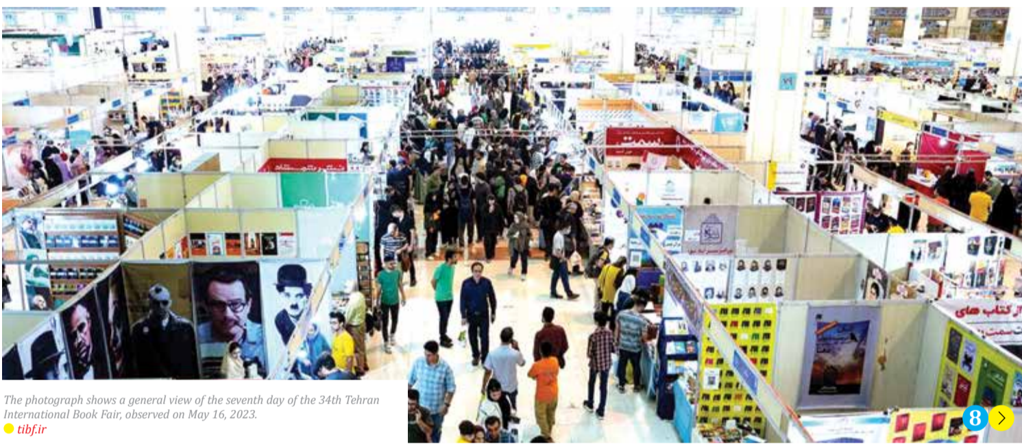
The photograph shows a general view of the seventh day of the 34th Tehran International Book Fair, observed on May 16, 2023.