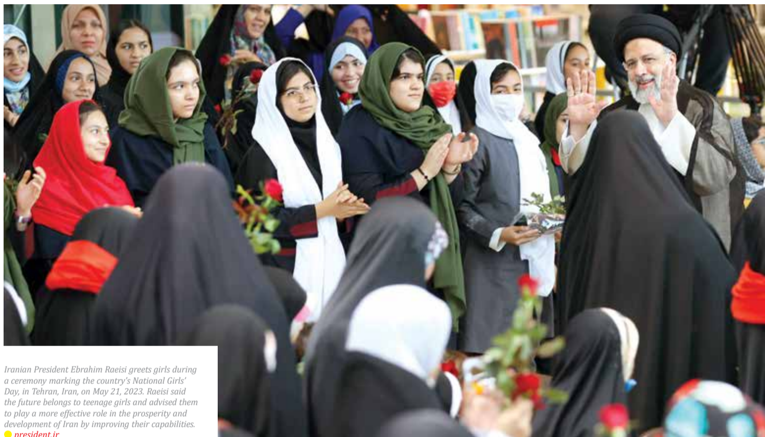
Iranian President Ebrahim Raisi greets girls during a ceremony marking the country's National Girls' Day, in Tehran, Iran, on May 21, 2023. Raisi said the future belongs to teenage girls and advised them to play a more effective role in the prosperity and development of Iran by improving their capabilities.