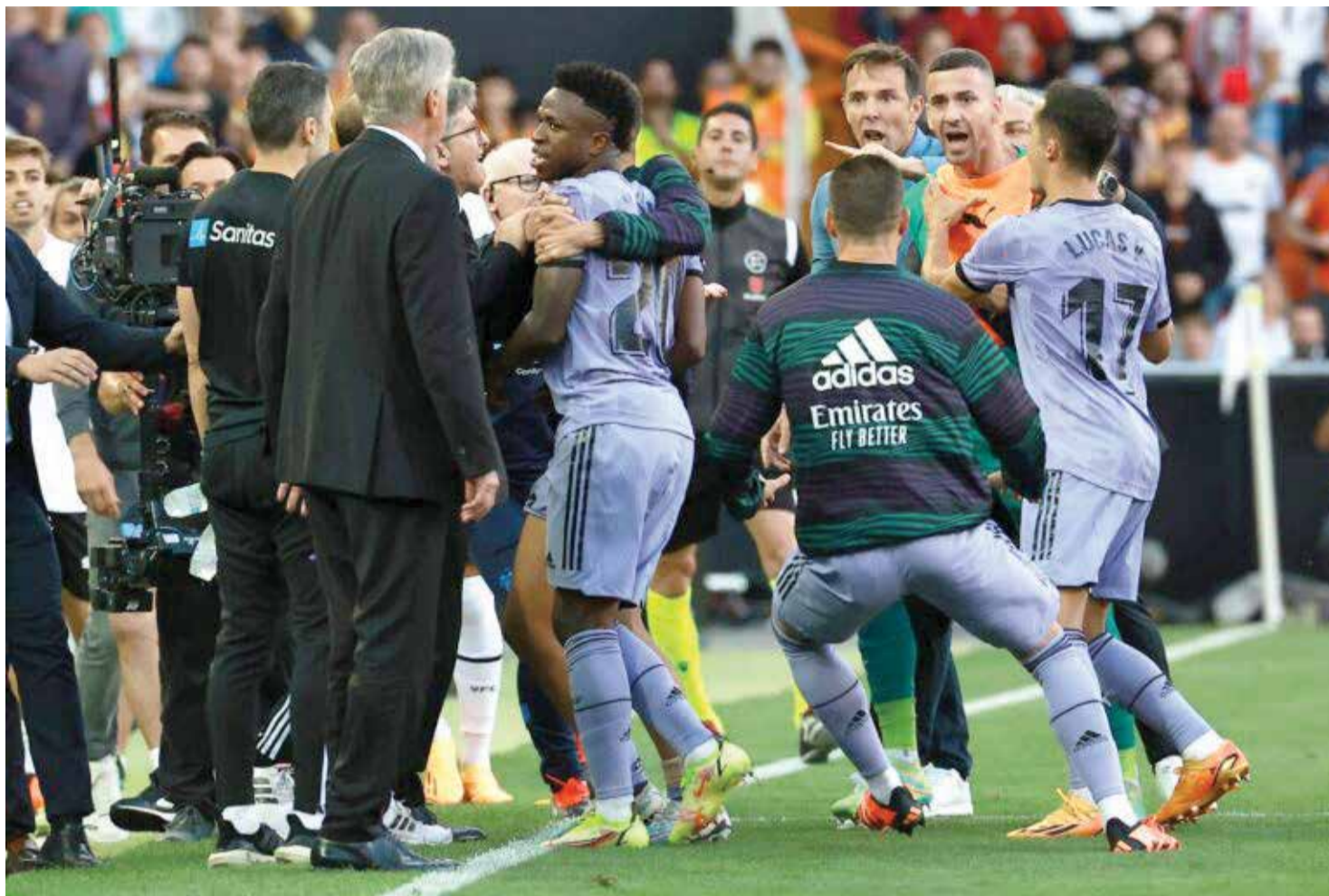
Real Madrid's Brazilian forward Vinicius Júnior (C) leaves after being sent off the pitch by the referee during the Spanish league football match between Valencia CF and Real Madrid CF at the Mestalla stadium in Valencia on May 21, 2023.

"I am strong and I will go all the way against the racists. Even if it is far away from here," he added. Real's manager, Carlo Ancelotti, also spoke out against the incident on social media, saying: "Today has been a sad day at Mestalla, where a group of fans have shown their worst version. It is time to stop talking and act forcefully. Racism has no place in football or in society. NO TO RACISM ANYWHERE".