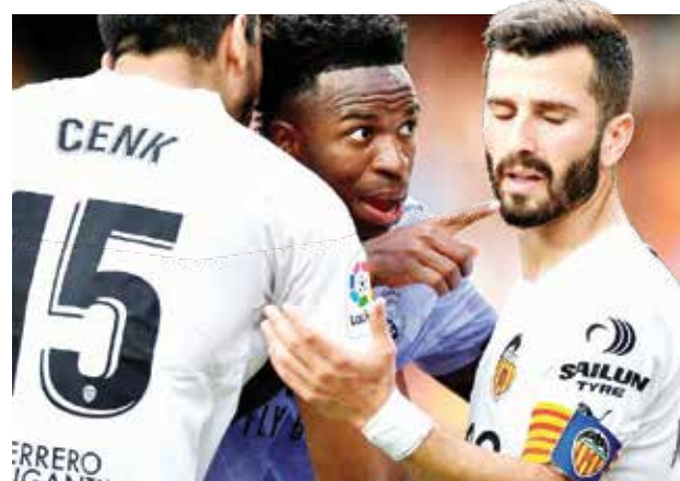
Real Madrid's Vinicius Junior (C) gestures towards a fan after witnessing racial abuse in a LaLiga match against Valencia at Mestalla, Valencia, Spain, on May 21, 2023.

However, last week the Italian said he would honour the last year of his contract at the Bernabeu.