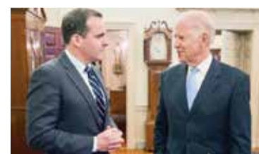
Brett McGurk (l), White House coordinator for the Middle East, talks with U.S. President Joe Biden.

Brett McGurk, U.S. President Joe Biden's senior Middle East adviser, took a low-profile trip to Oman earlier this month for talks with Omani officials on a possible diplomatic outreach to Iran regarding its nuclear program, according to five U.S., Israeli and European officials. Axios reported in April that the Biden administration discussed with its European and Israeli partners a possible proposal for an interim agreement with Iran that would include some sanctions relief in exchange for Tehran freezing parts of its nuclear program. McGurk traveled to Muscat on May 8 after a trip to Saudi Arabia with national security adviser, Jake Sullivan, and a visit to Israel to brief Prime Minister Ne-