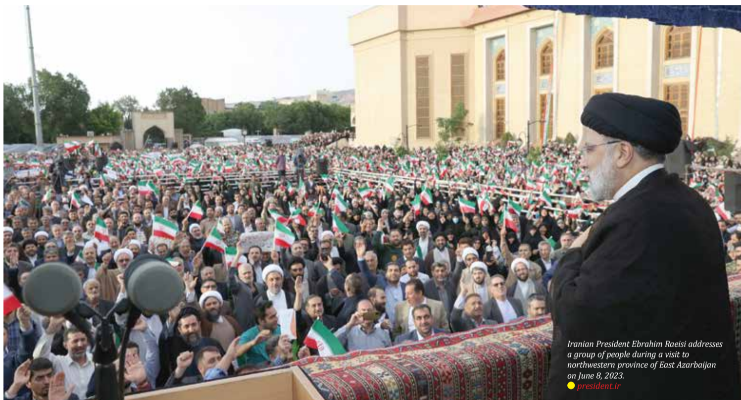
Iranian President Ebrahim Raeisi addresses a group of people during a visit to northwestern province of East Azarbaijan on June 8, 2023.