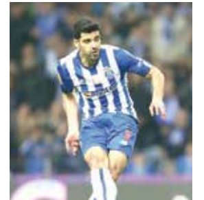
● CATERINA MORAIS/KAPTA+