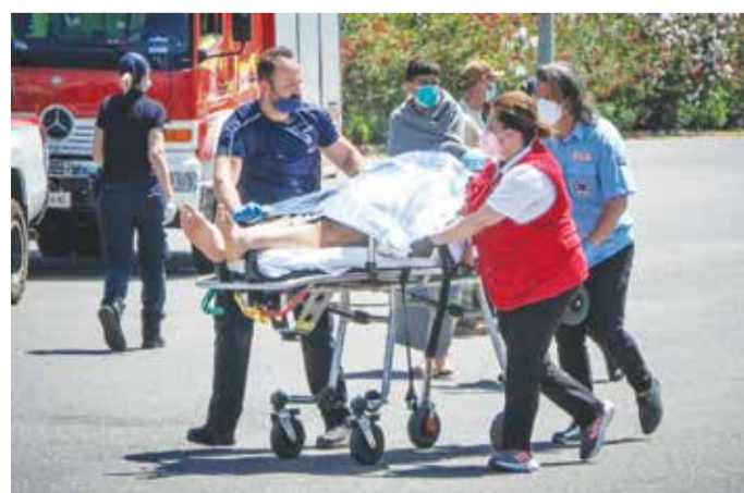
A migrant is transferred by rescue personnel, following a rescue operation, after their boat capsized at open sea, in Kalamata, Greece, on June 14, 2023.

Separately Wednesday, a yacht with 81 migrants on board was towed to a port on the south coast of Greece's island of Crete after authorities received a distress call.