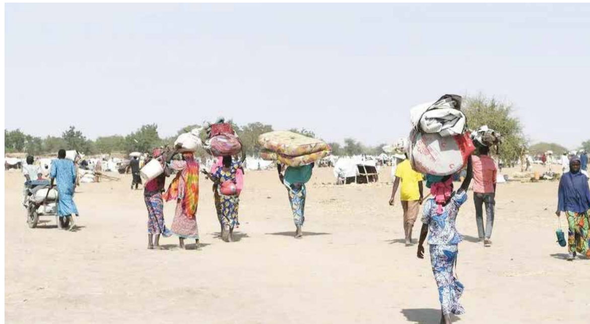
● XAVIER BOURGOIS/UNHCR

Turkey currently hosts the most refugees with 3.8 million people, mostly Syrians who fled the war, followed by Iran with 3.4 million refugees, mostly Afghans. But there are also 5.7 million Ukrainian refugees scattered across countries in Europe and beyond. The number of stateless people has also risen in 2022