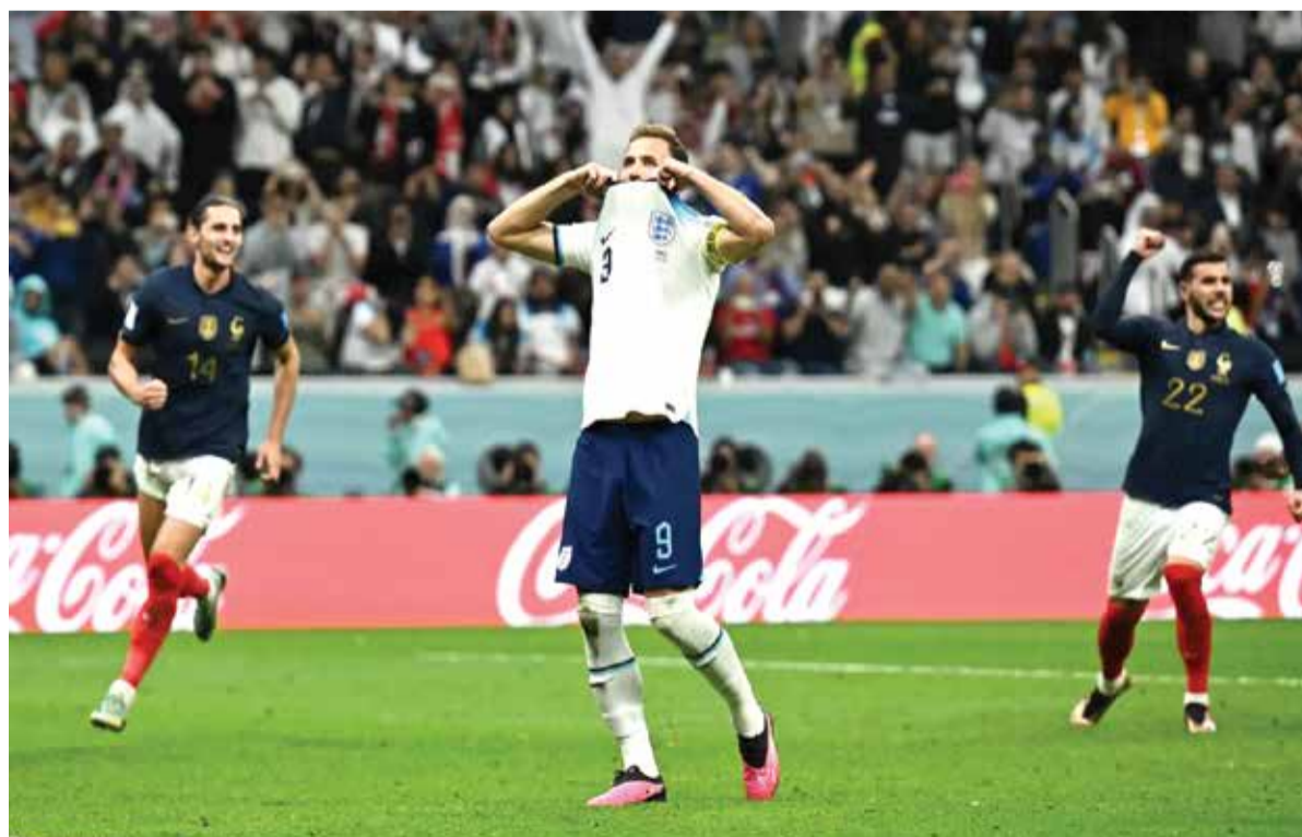
England captain Harry Kane is frustrated after missing a late penalty during a 2-1 quarter-final defeat against France in the World Cup 2022 in Qatar.

"Social media companies' responses to abuse and threat published on