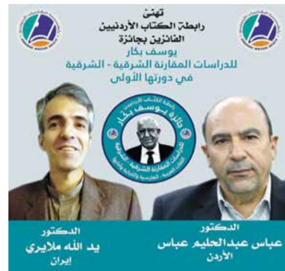
winners at a later date, underscoring the Association's commitment to honoring and acknowledging their exceptional contributions.