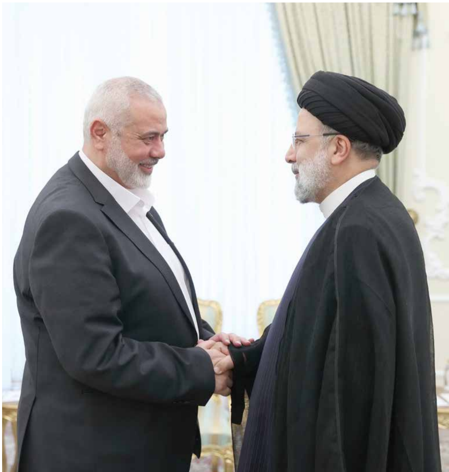
Iranian President Ebrahim Raeisi (r) shakes hands with Ismail Haniyeh, the head of the political bureau of the Palestinian resistance movement Hamas, in Tehran on June 20, 2023.

International Desk Iranian President Ebrahim Raeisi said victories of the resistance front have proven that the Israeli regime's alleged deterrent power is fake, as tensions are growing between the regime and Palestinian resistance fighters. "The victories of the resistance front have revealed and proved that the image that the Israeli regime is trying to portray of its alleged deterrent power is not real," President Raeisi told the visiting head of the political bureau of the Pal-