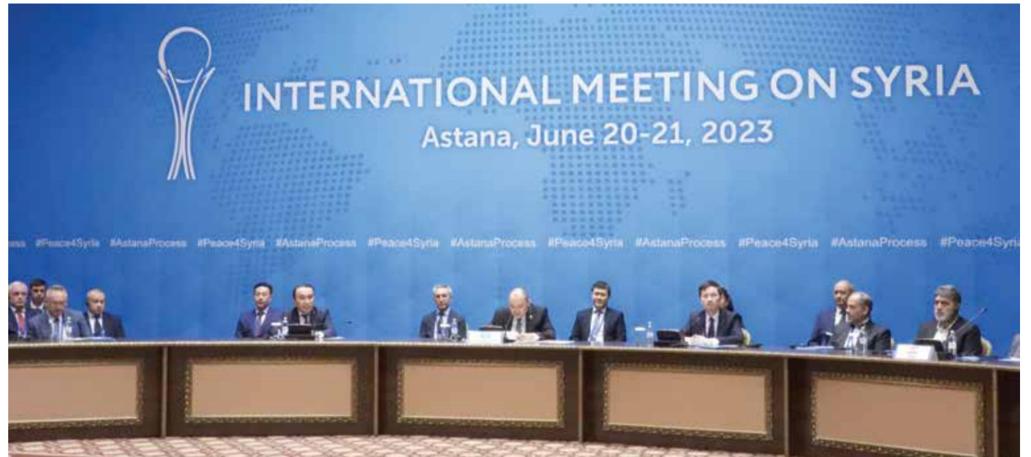
Delegations from Iran, Russia, Turkey, and Syria discuss the peace process in Syria at the 20th round of Astana talks in Astana, Kazakhstan, on June 21, 2023.

Iran, Russia, Turkey, and Syria on Wednesday condemned the actions of nations supporting "terrorist entities" in northeastern Syria as they assembled for Astana peace talks in Kazakhstan. The guarantor countries reject "illegitimate self-rule initiatives" in Syria implemented under the pretext of fighting terrorism, a joint statement read, according to Daily Sabah. Reiterating their resolve to combat terrorism, the