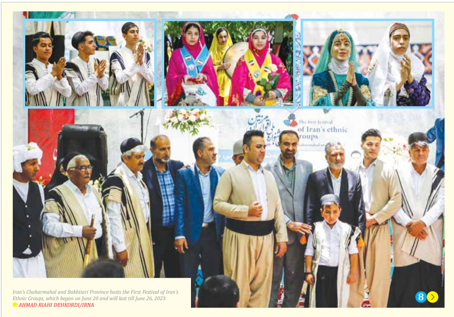
Iran's Chaharmahal and Bakhtiari Province hosts the First Festival of Iran's Ethnic Groups, which began on June 20 and will last till June 26, 2023.