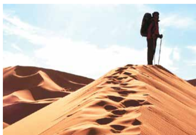
Maranjab Desert dalahoo.com

Fin Garden is a unique combination of natural and man-made elements. The fascinating gardening method, the complicated irrigation system, and the beautiful stained glass windows are only parts of the beauties of the internationally known garden located in the heart of the