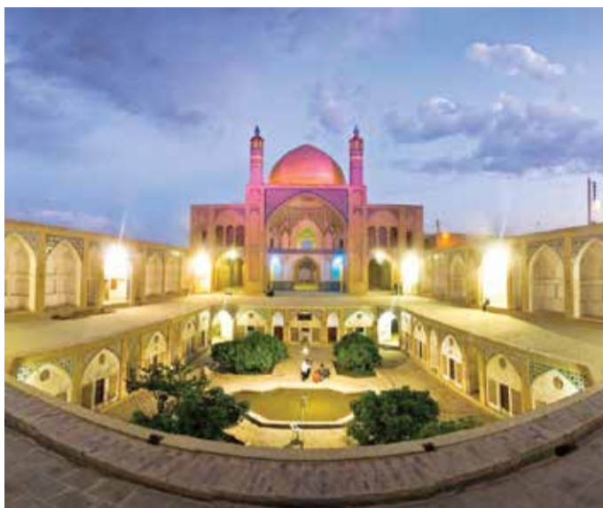
Agha Bozorg Mosque itto.org