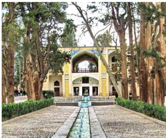
Fin Garden apochi.com