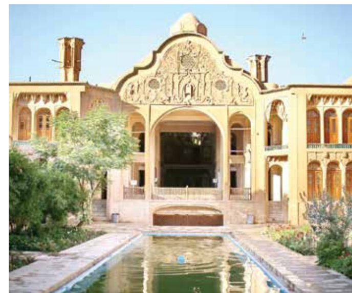
Borujerdi House apochi.com

Kashan, a city in the central province of Isfahan, is one of the most alluring destinations in Iran, as it offers numerous historical houses and structures with fascinating architecture, such as the beautiful Fin Garden and the historical bazaar of Kashan. Kashan is internationally famous for producing carpets, silk and other textiles. Years ago, Kashan was a significant center of pottery and tile production, and even the name "Kashan" is derived from "kashi," which means 'tile' in Persian, vipemo.com wrote.