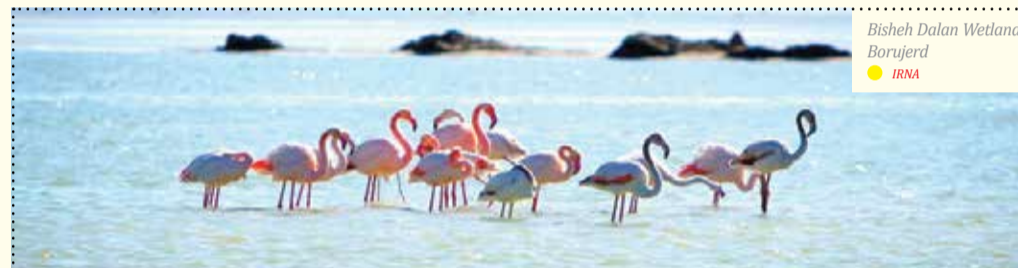
Bisheh Dalan Wetland, Borujerd

Watching this greenery next to its oak forests and rivers full of water creates an indescribable pleasure for travelers, especially nature lovers.