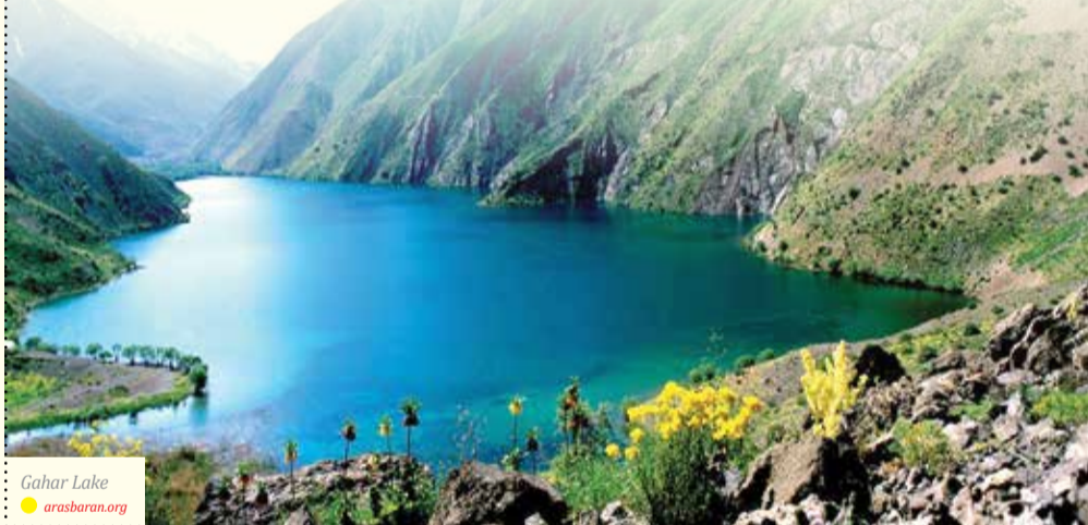
Gahar Lake

the east, Aligoodarz in the south, and Khorramabad in the west. Bisheh Waterfall is located 30km southeast of Dorud, in a village of the same name.