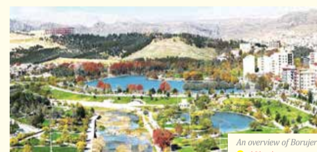
An overview of Borujerd ● visitiran.ir