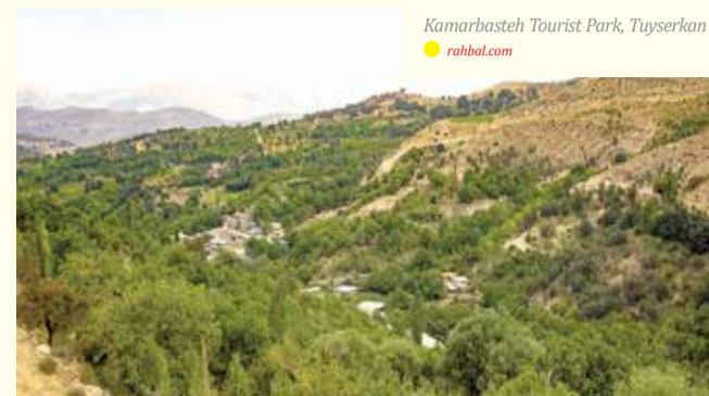
Kamarbaste Tourist Park, Tuyserkhan ● rahhal.com

heating devices. The cities located in the west and southwest of Iran are among the desirable travel destinations in the summer, according to IRNA.