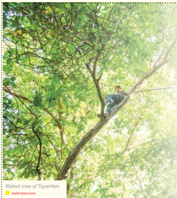
Walnut tress of Tuyserkhan