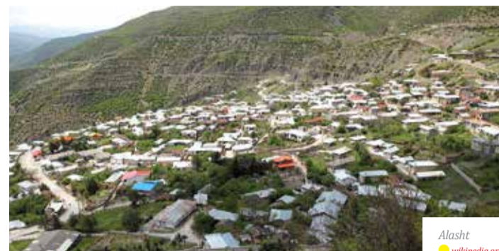
Alasht ● wikipedia.org

popular and worth visiting. Additionally, the only observatory in northern Iran is located in this city. It is recommended that you visit this observatory for stargazing. The Dokhtar Pak Temple is also considered a tourist attraction. Before the advent of Islam, it was the Anahita Temple, and is accessible only to women.