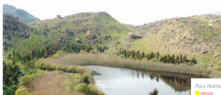
Pol-e Dokhtar ● itto.org

One of the best choices for summer trips in Iran is Lorestan Province. Cool hills, magnificent mountains, and natural waterfalls can give