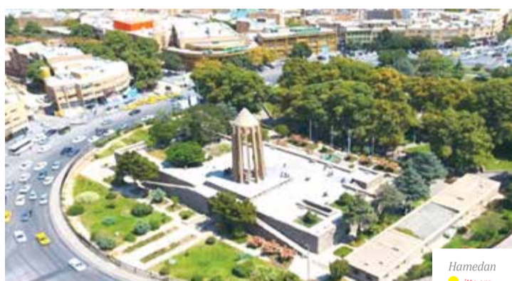
Hamedan