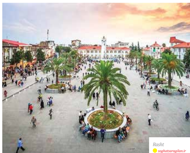
Rasht

Rasht, the capital of Gilan Province, is known for its mild and pleasant climate throughout the year. It is a great city to escape the summer heat. Rasht is famous for its delicious local cuisine and vibrant cultural scene, making it a fascinating destination for food enthusiasts and art lovers. When in Rasht, don't miss visiting the Gilan Rural Heritage Museum, which offers insights into the traditional architecture and lifestyle of the region. You can also explore the historical Tabarsi House, Sheikh Zahed Gilani Tomb, and the picturesque Anzali Lagoon nearby.