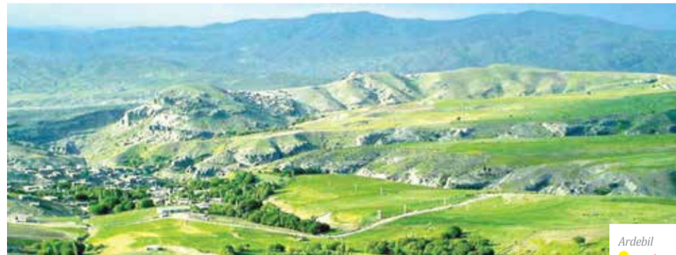
Ardebil

houses, along with its placement on the slopes of the Alborz Mountains and its proximity to the dense forests of the north, creates a delightful experience that makes a summer trip to Massouleh unforgettable.