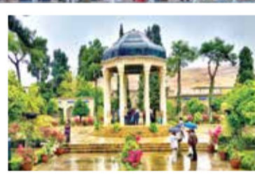
Tomb of Hafez

The provincial capital of Shiraz is also home to the tombs of Hafez and Sa’di. Hafez was a 14th century poet whose works can be found in almost every Iranian home. His tomb is usually crowded with visitors. The tomb is raised up on a beautifully decorated dais, surrounded by fragrant rose