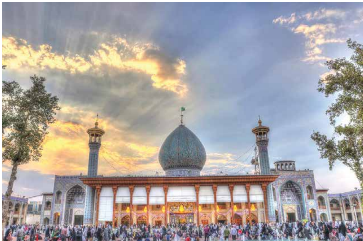
Shah Cheragh Shrine

Persepolis was the ceremonial capital of the Achaemenid Empire (550–330 BC). It literally means “city of Persians”. Persepolis is situated 60 kilometers northeast of Shiraz. The earliest remains of Persepolis date back to 515 BC.