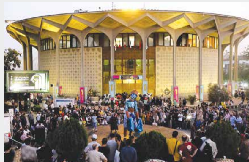
The photos capture a street performance of the 19th Tehran-Mubarak International Puppet Festival in the vibrant backdrop of Tehran's City Theater. The festival, under the guidance of Hadi Hejazifar, commenced on June 28 and will enrapture audiences until July 8.