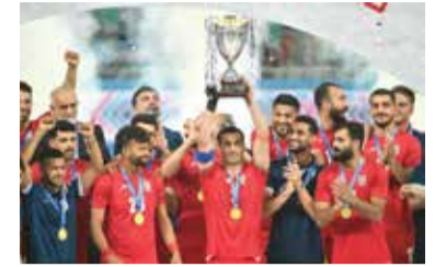
Iranian players celebrate lifting the CAFA Nations Cup trophy after a victory over Uzbekistan in the final in Tashkent, Uzbekistan, on June 20, 2023.