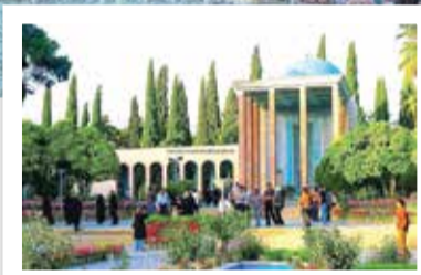
Tomb of Sa'di apochi.com

Shiraz ranks among Iran’s medical and therapeutic hubs. It provides high