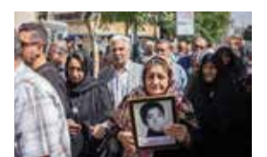
Iranian protesters and relatives of members of the MKO terrorist cult gather outside the Turkish Embassy in Tehran on June 30, 2023.

The protesters released a communiqué during the gathering, asking Albanian