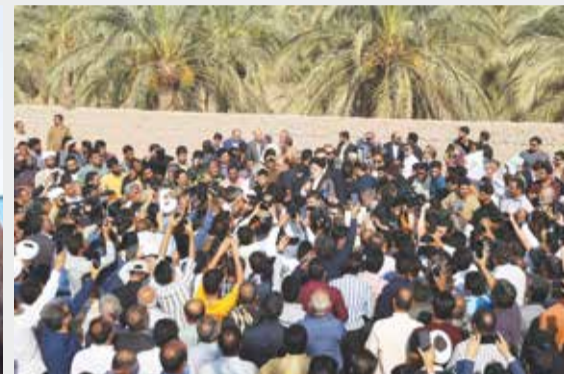
Iranian President Ebrahim Raeisi inaugurates a national project on June 29, 2023, to transfer water from the Nesa Dam's reservoir to the cities of Bam and Baravat in Kerman Province, southern Iran.