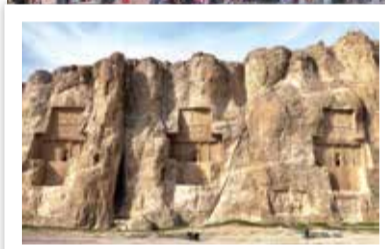
Naqsh-e Rostam