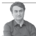
By Abed Akbari CEO of Abrar Moaser Research Institute

"For the continuation of the government and the reputation of Finland, I see that it is impossible for me to continue as a minister in a satisfactory way," Junnila said in a statement.