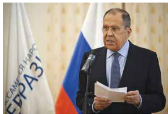
➔ Russian Foreign Minister Sergei Lavrov gives a speech during the opening of the Shanghai Cooperation Organization (SCO) National Peoples Diplomacy Centre in Moscow, Russia, on June 30, 2023.

Iran will be formally approved as a member of the regional Shanghai Cooperation Organisation with China, Russia and Central Asian countries, Russian Foreign Minister Sergei Lavrov said Friday. "At the meeting of heads of state on July 4, the full membership of Iran will be approved," Lavrov said at the opening of an SCO centre in Moscow, AFP reported.