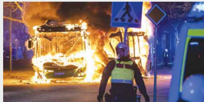
Muslims blast the Wednesday burning of Qur'an's pages outside Stockholm Central Mosque, which was authorized by the Swedish court and protected by the police.