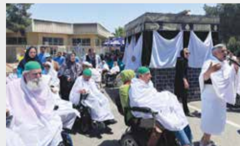
A ceremony commemorating the auspicious occasion of Eid al-Adha and the symbolic circumambulation of Kaaba takes place on June 29, 2023, with the presence of philanthropists, benefactors, and artists at Kahrizak Charity Foundation.